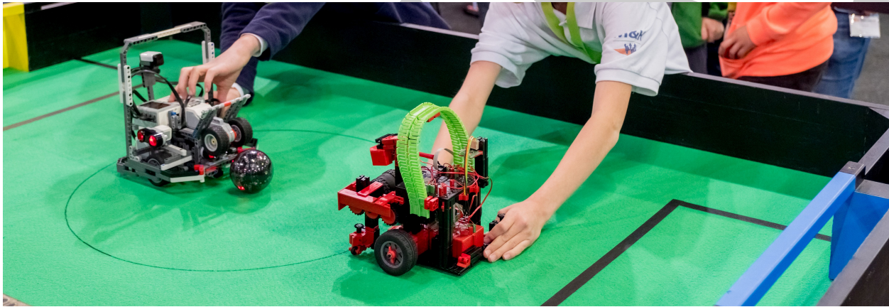
Figure 1 Two teams with one LWL robot each will compete using an IR ball on RCJ Soccer fields without the out-area. There is no need for using camera vision or line detection.